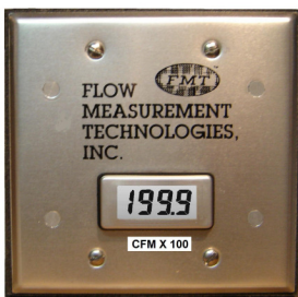
Transmitter With Optional Display