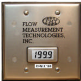
Remote Transmitter with Optional Display